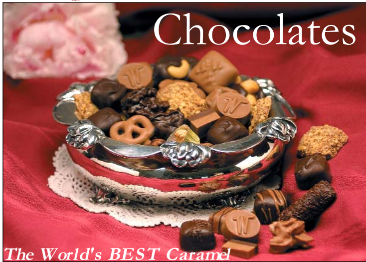
The World's BEST Caramel